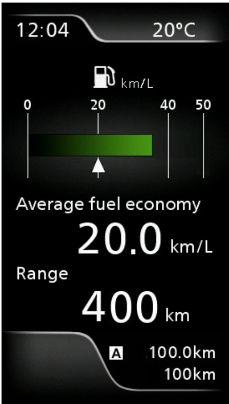
AVERAGE FUEL ECONOMY