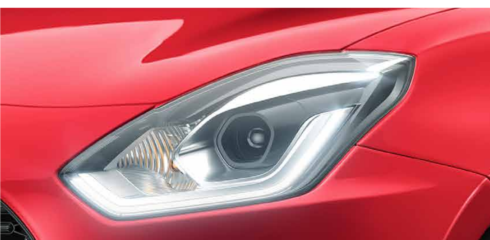
LED PROJECTOR HEADLAMPS WITH DAY TIME RUNNING LAMPS