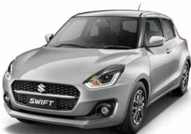
METALLIC SILKY SILVER