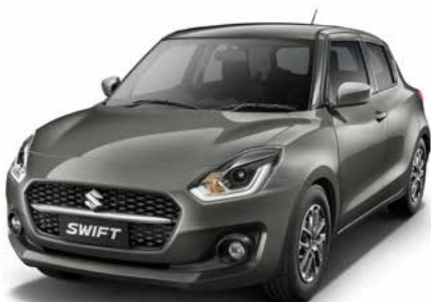
METALLIC MAGMA GREY