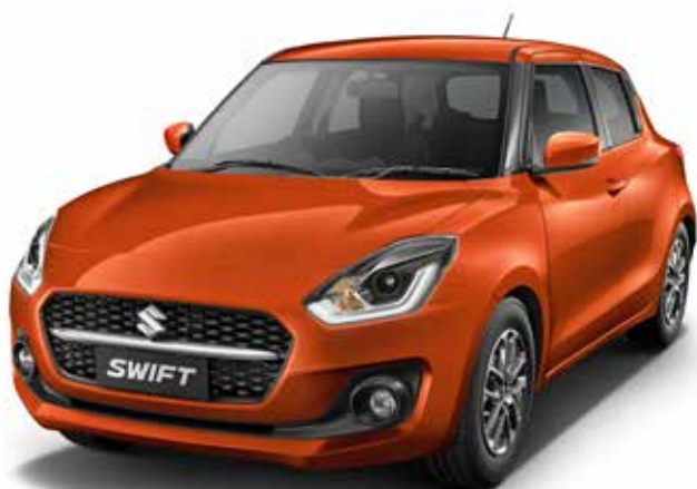
PEARL METALLIC LUCENT ORANGE