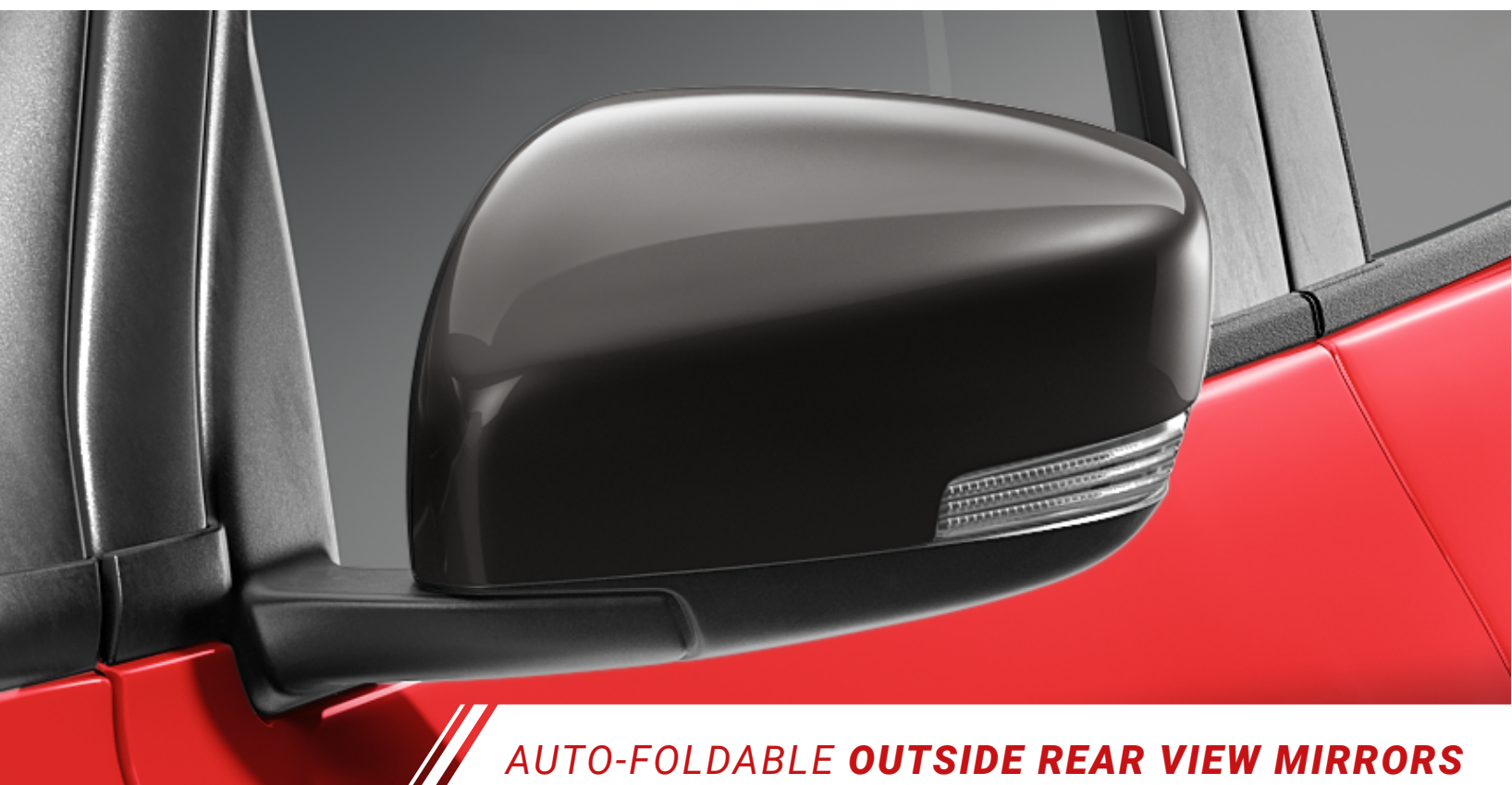
AUTO-FOLDABLE OUTSIDE REAR VIEW MIRRORS