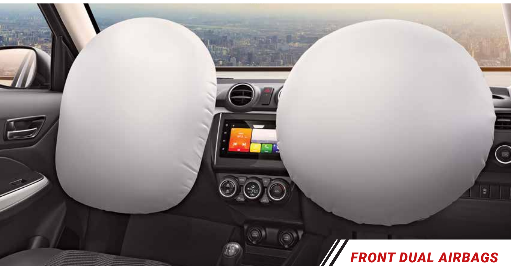
FRONT DUAL AIRBAGS