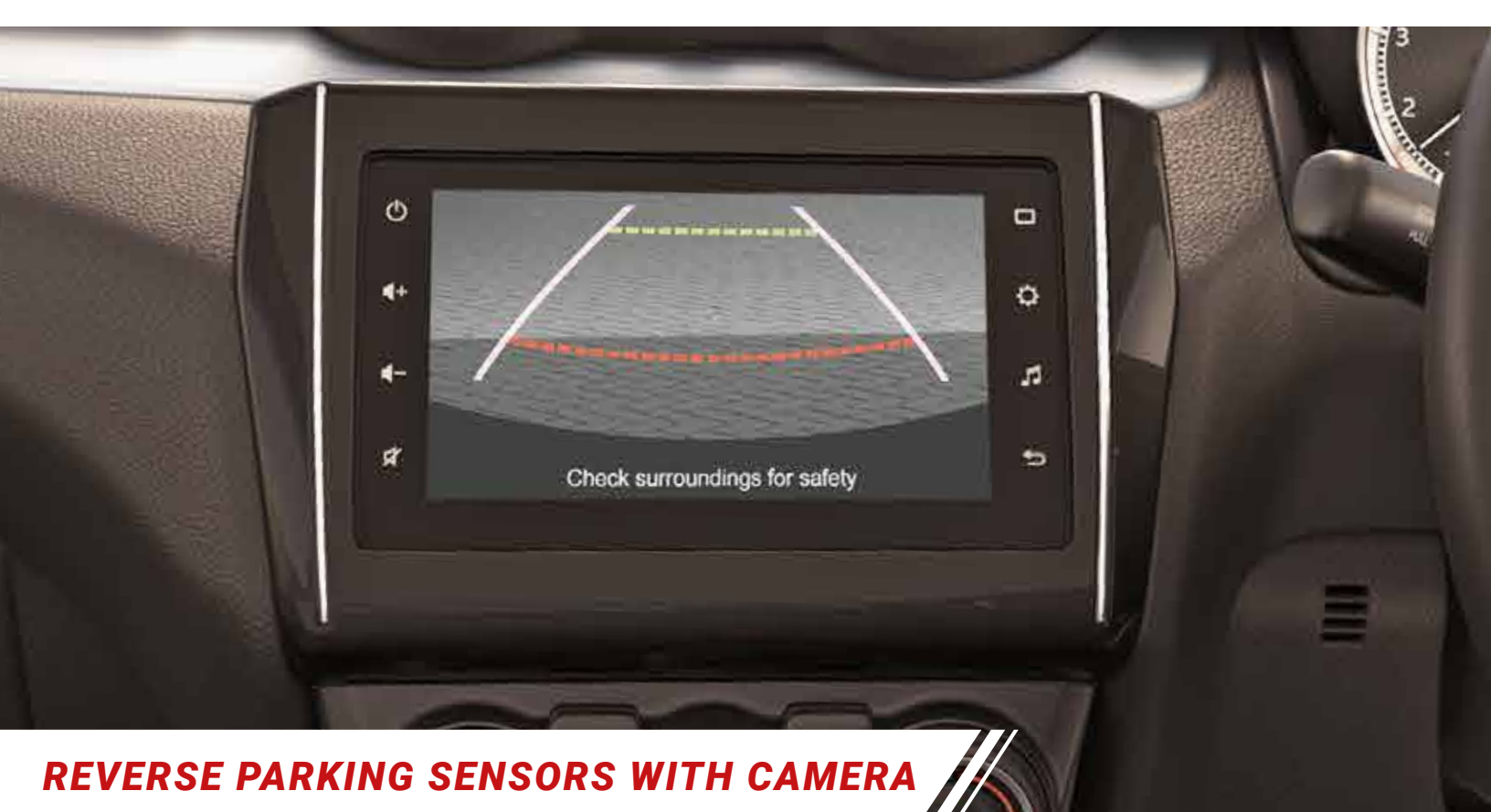
REVERSE PARKING SENSORS WITH CAMERA