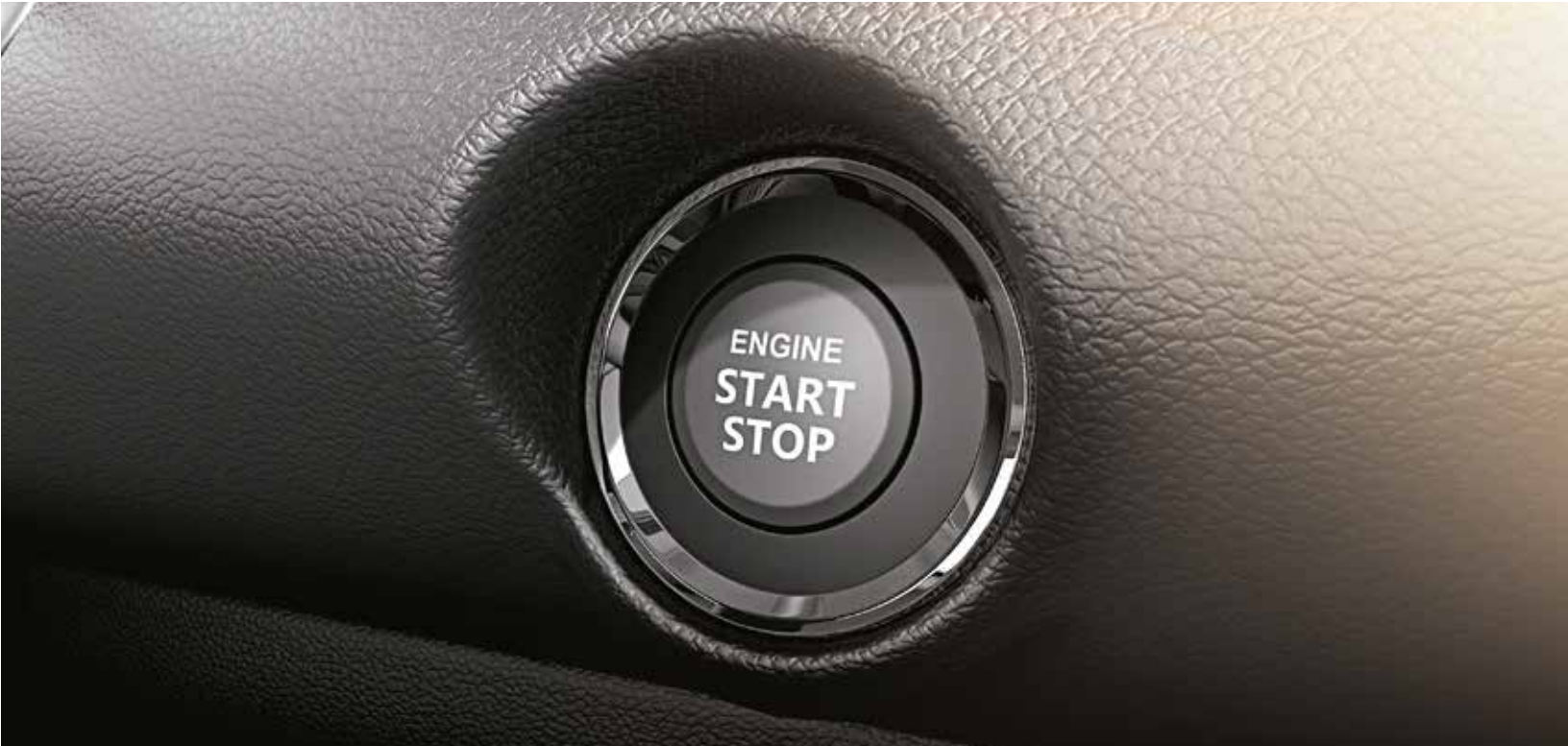
PUSH START-STOP BUTTON