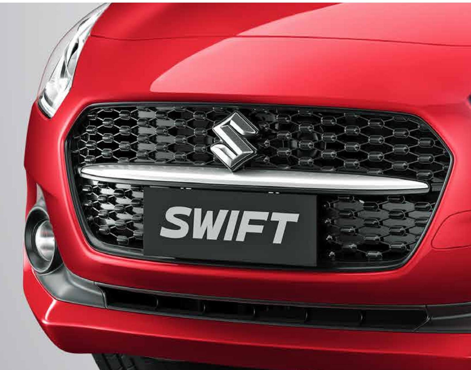
SPORTY CROSS MESH GRILLE WITH BOLD CHROME ACCENT