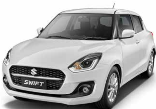
PEARL ARCTIC WHITE