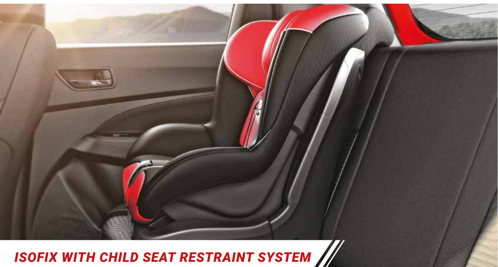
ISOFIX WITH CHILD SEAT RESTRAINT SYSTEM