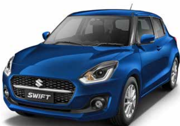
PEARL METALLIC MIDNIGHT BLUE