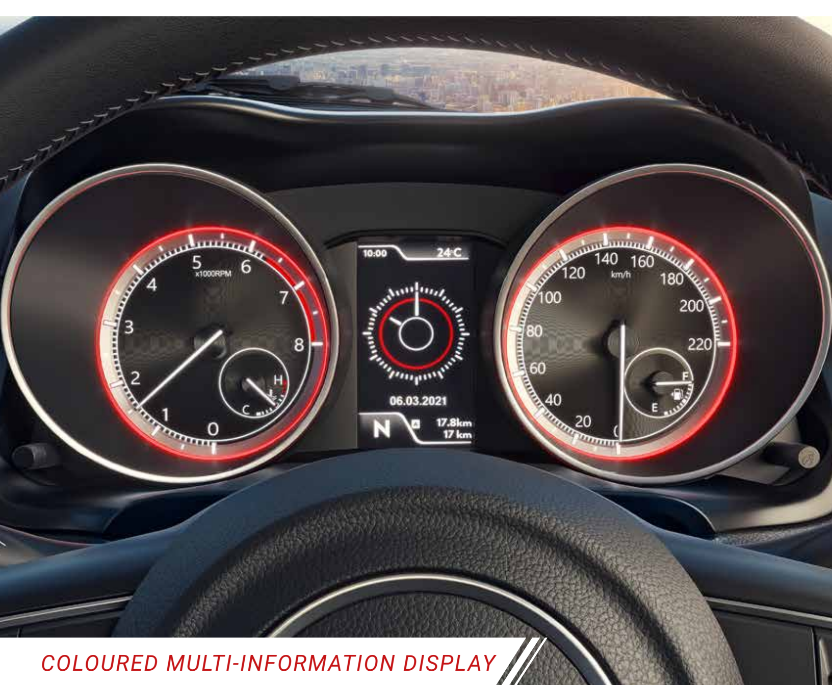
COLOURED MULTI-INFORMATION DISPLAY