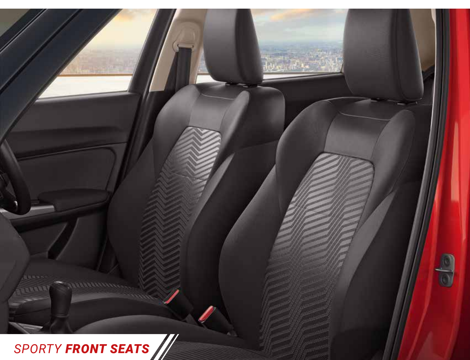
SPORTY FRONT SEATS