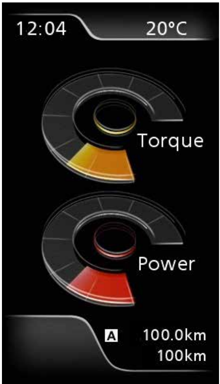
POWER & TORQUE