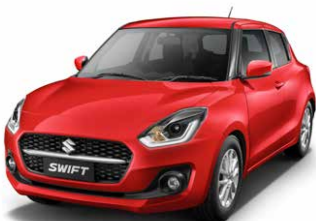
SOLID FIRE RED