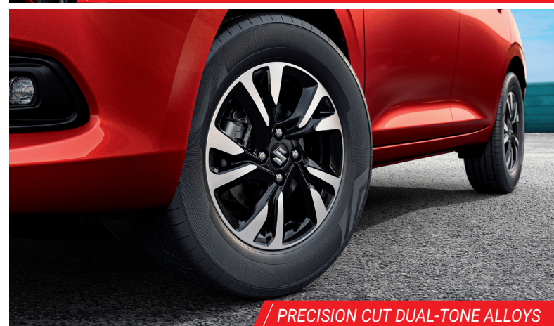
/ PRECISION CUT DUAL-TONE ALLOYS