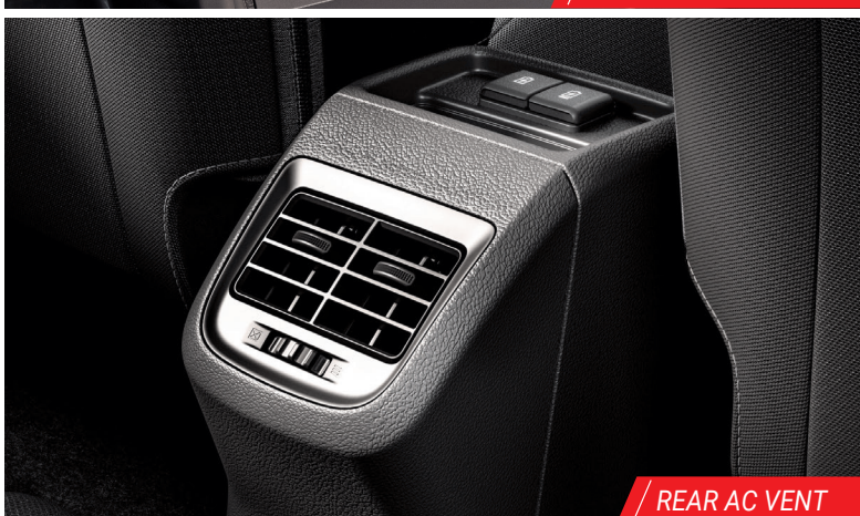
REAR AC VENT