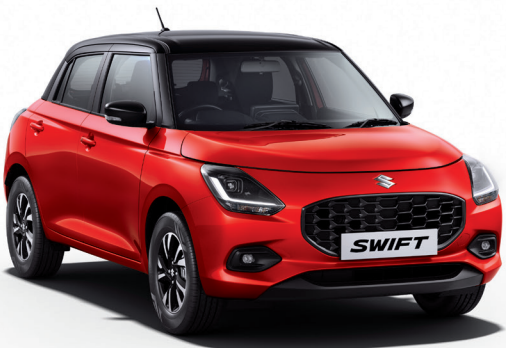
Sizzling Red with Midnight Black Roof