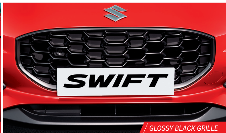
/ GLOSSY BLACK GRILLE