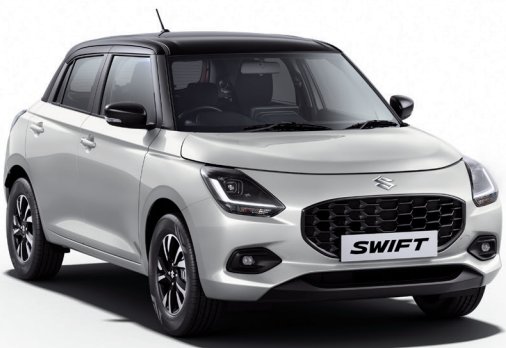
Pearl Arctic White with Midnight Black Roof