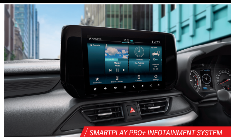
SMARTPLAY PRO+ INFOTAINMENT SYSTEM

No words can describe what you'll feel when you enter the Epic New Swift. But we'll try. This car is designed with ample space keeping your comfort in mind and its Sporty All-Black Interiors make every drive truly stylish. The real head-turner is the sleek and futuristic center console, with a driver-oriented cockpit for easy access.