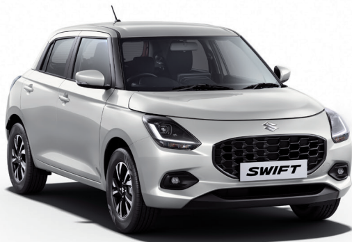
Pearl Arctic White