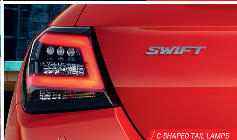
/ C-SHAPED TAIL LAMPS