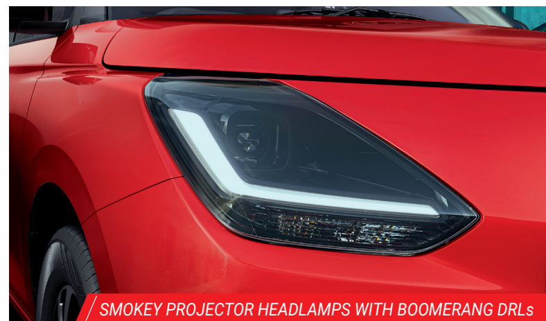
/ SMOKEY PROJECTOR HEADLAMPS WITH BOOMERANG DRLs

With its bold stance and sporty design, the Epic New Swift is quite the looker. It is pure passion crafted into an expression of thrill. As it approaches, heartbeats go up, and you know it is something special.