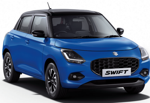
Luster Blue with Midnight Black Roof